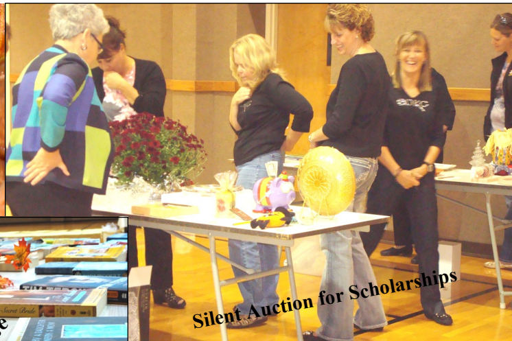
Silent Auction for Scholarships